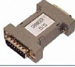
KA0304 D-Sub 15p to 15p Assembly Adapter (M/M or M/F or F/F)