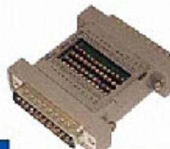
KA1005 RS232 Mini Wiring Box D-Sub 25p to 25p Assembly Adapter (M/M or M/F or F/F)