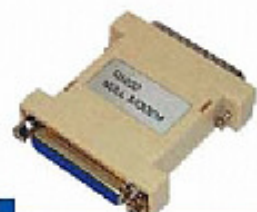
KA1006 RS232 Null Modem D-Sub 25p to 25p Assembly Adapter (M/M or M/F or F/F)