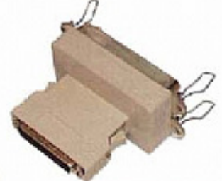
KA0605 Centronic 50p (F)*2 to MC 50p (M) Molded Adapter