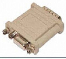
KA0301 D-Sub 15p to HD 15p Molded Adapter (M/F or F/F)