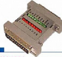
KA1001 RS232 Quick Tester D-Sub 25p (M) to 25p (F) Assembly Adapter w/16*Led