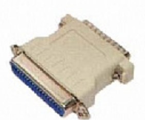
KA0307 D-Sub 25p to Centronic 36p Molded Printer Adapter (M/M or M/F or F/F)