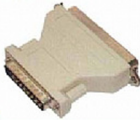
KA0407 D-Sub 25p to Centronic 50p Molded Adapter ( M/M or M/F or F/F)