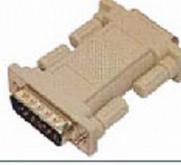
KA0303 D-Sub 15p to 15p Molded Adapter (M/M or M/F or F/F)