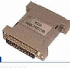
KA0903 RS232 Surge Protector D-Sub 25p to 25p Assembly Adapter (M/M or M/F or F/F)