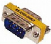
KAO701 D-Sub 9p to 9p ( M/M or M/F or F/F)