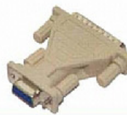
KA0206 D-Sub 9p to 25p Molded Adapter (M/M or M/F or F/F)