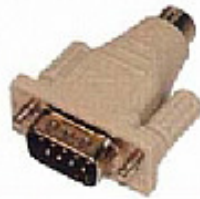
KA0106 Mini Din 6p to D-Sub 9p Molded Adapter ( M/F or F/M or F/F)