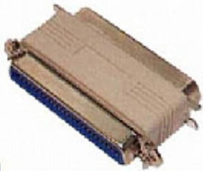
KA0507 Centronic 50p to 50p Molded Adapter ( M/M or M/F or F/F)