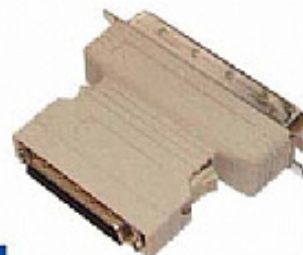
KA0601 Centronic 50p to MC 50p Molded Adapter ( M/M or F/M )