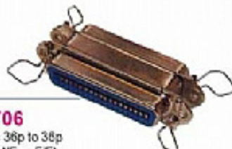
KAO706 Centronic 36p to 36p ( M/M or M/F or F/F)