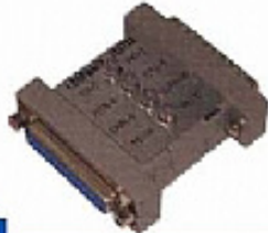
KA1003 RS232 Loop Back Tester D-Sub 25p (M) to 25p (F) Assembly Adapter w/4*Led