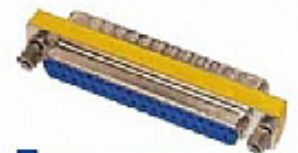
KAO705 D-Sub 37p to 37p ( M/M or M/F or F/F)