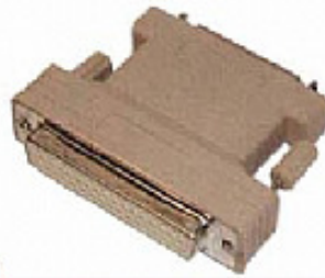
KA0604 D-Sub 50p to MD 50p Molded Adapter ( M/M or F/M or F/F)