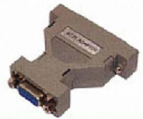
KA0207 D-Sub 9p to 25p Assembly Adapter (M/M or M/F or F/F)