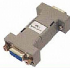
KA0204 HD 15p to 15p Assembly Adapter (D-Sub 9p/9p, 9p/15p, M/M or M/F or F/F)