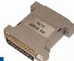
KA1004 RS232 Jumper Box D-Sub 25p to 25p Assembly Adapter (M/M or M/F or F/F)