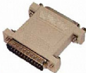
KA0305 D-Sub 25p to 25p Molded Adapter (M/M or M/F or F/F)