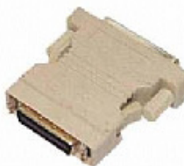
KA0504 D-Sub 25p to MC 36p Molded Adapter (M/M or M/F)