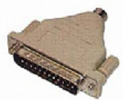
KA0201 Mini Din 6p to D-Sub 25p Molded Adapter ( M/M or M/F or F/M or F/F)