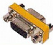
KAO702 HD 15p to 15p ( M/M or M/F or F/F)