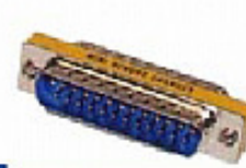
KAO704 D-Sub 25p to 25p ( M/M or M/F or F/F)