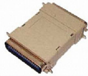
KA0403 Centronic 36p to 36p Assembly Adapter ( M/M or M/F or F/F)