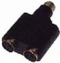
KA0105 Mini Din 6p (M) to 6p (F/F) Molded Adapter