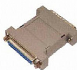
KA0306 D-Sub 25p to 25p Assembly Adapter (M/M or M/F or F/F)