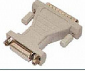
KA0404 D-Sub 15p to 25p Molded Adapter (M/M or M/F or F/F)