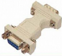
KA0203 D-Sub 9p to 9p Molded Adapter (9p/15p, HD 15p/15p, M/M or M/F or F/F)