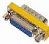
KAO703 D-Sub 15p to 15p ( M/M or M/F or F/F)