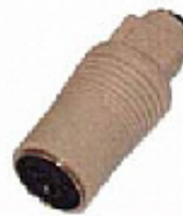
KA0102 Mini Din 6p to Din 5p Molded Adapter ( M/M or M/F or F/M or F/F)