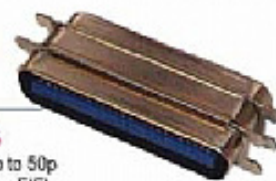
KAO706 Centronic 50p to 50p ( M/M or M/F or F/F)