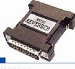
KA0904 RS232 Reverser D-Sub 25p to 25p Assembly Adapter (M/M or M/F or F/F)