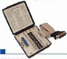
KA0905 RS232 Break-OUT Box to D-Sub 25p (M) w/Flat Cable