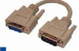
KR0906 D-Sub 15p to 15p Molded Cable (M/M or M/F or F/F)