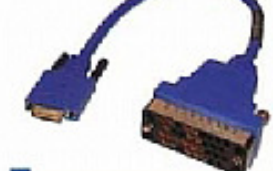
KSC0305 Cisco No. CAB-SS-V.35FC | 26p (M) to V.35 (F) Molded Cable