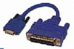
KSC0207 Cisco No. CAB-SS-232MT | 26p (M) to D-Sub 25p (M) Molded Cable