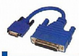
KSC0206 Cisco No. CAB-SS-232FC | 26p (M) to D-Sub 25p (F) Molded Cable