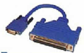
KSC0303 Cisco No. CAB-SS-449FC | 26p (M) to D-Sub 37p (F) Molded Cable