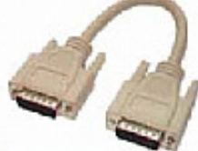
KR0801 HD 26p to 26p Molded Cable (M/M or M/F or F/F)