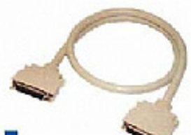
KSRP104 IEEE 1284 MC 36p (M) to MC 36p (M) Molded Cable