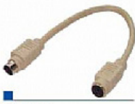
KR1606 Mini Din 6p to 6p Molded Cable (M/M or M/F or F/F)