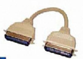
KSRP107 IEEE 1284 Centronic 36p (M) to (M) Molded Cable