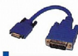
KSC0205 Cisco No. CAB-SS-X21MT | 26p (M) to D-Sub 15p (M) Molded Cable