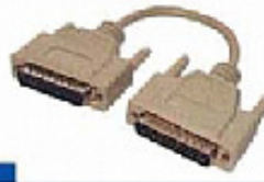
KR0806 D-Sub 25p to 25p Molded Cable (M/M or M/F or F/F)