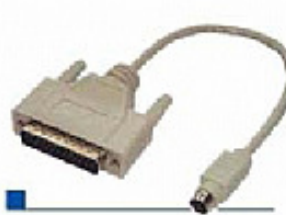
KR1507 Mini Din 8p (M) to D-Sub 25p (M) Molded Cable