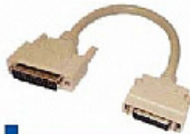
KSRP102 IEEE 1284 D-Sub 25p (M) to MC 36p (M) Molded Cable