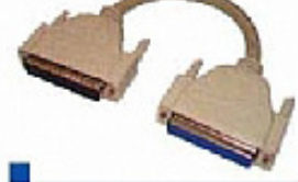
KR1204 D-Sub 50p to 50p Molded Cable (M/M or M/F or F/F)