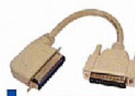
KSRP105 IEEE 1284 D-Sub 25p (M) to Centronic 36p (M) 90° Molded Cable