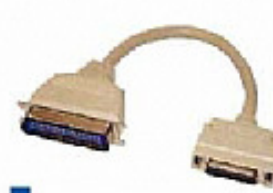
KSRP103 IEEE 1284 Centronic 36p (M) to MC 36p (M) Molded Cable