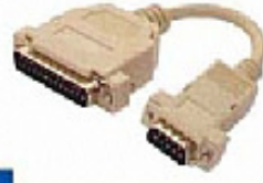
KR0104 D-Sub 9p to 25p Assembly Cable (M/M or M/F or F/F)