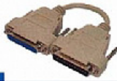
KR0805 D-Sub 25p to 25p Assembly Cable (M/M or M/F or F/F)