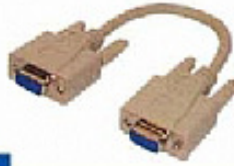
KR1101 D-Sub 9p to 9p Molded Cable (M/M or M/F or F/F)