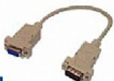
KR1004 HD 15p to 15p Assembly Cable (M/M or M/F or F/F)