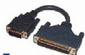
KSC0107 Cisco No. CAB-449FC | LFH 60p (M) to D-Sub 37p (F) Molded Cable