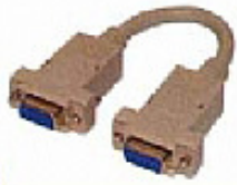
KR1102 D-Sub 9p to 9p Assembly Cable (M/M or M/F or F/F)