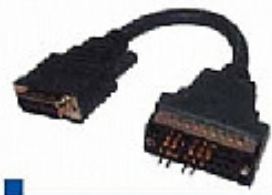
KSC0203 Cisco No. CAB-V.35MT | LFH 60p (M) to V.35 (M) Molded Cable