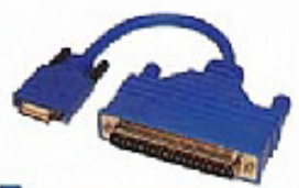
KSC0304 Cisco No. CAB-SS-449MT | 26p (M) to D-Sub 37p (M) Molded Cable