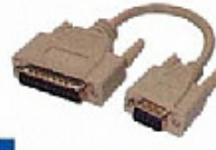
KR0105 D-Sub 9p to 25p Molded Cable (M/M or M/F or F/F)