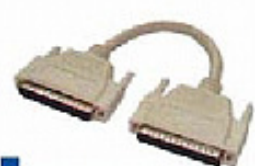
KR1201 HD 62p to 62p Molded Cable (M/M or M/F or F/F)