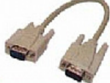
KR1005 HD 15p to 15p Molded Cable (M/M or M/F or F/F)