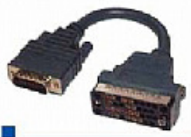
KSC0202 Cisco No. CAB-V.35FC | LFH 60p (M) to V.35 (F) Molded Cable