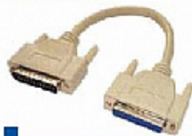
KSRP106 IEEE 1284 D-Sub 25p (M) to (F) Molded Cable