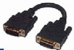
KSC0101 Cisco No. CAB-X21FC | LFH 60p (M) to D-Sub 15p (F) Molded Cable