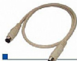
KR1503 Mini Din 4p to 4p Molded Cable (M/M or M/F or F/F)