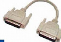
KR0706 HD 44p to 44p Molded Cable (M/M or M/F or F/F)