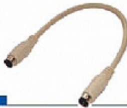
KR1501 Mini Din 8p to 8p Molded Cable (M/M or M/F or F/F)