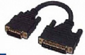
KSC0104 Cisco No. CAB-232MT | LFH 60p (M) to D-Sub 25p (M) Molded Cable