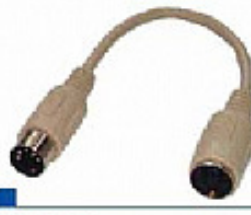
KR1601 Din 5p to 5p Molded Cable (M/M or M/F or F/F)