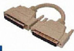
KR0506 D-Sub 37p to 37p Molded Cable (M/M or M/F or F/F)