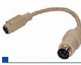
KR1609 Mini Din 6p to Din 5p Molded Cable (M/F or F/M)