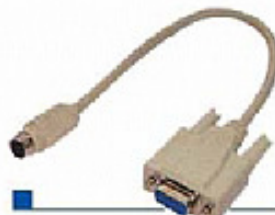
KR1506 Mini Din 8p (M) to D-Sub 9p (F) Molded Cable