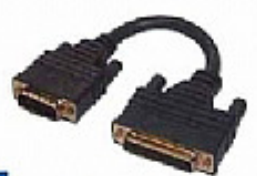
KSC0103 Cisco No. CAB-232FC | LFH 60p (M) to D-Sub 25p (F) Molded Cable