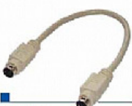
KR1509 Mini Din 9p to 9p Molded Cable (M/M or M/F or F/F)