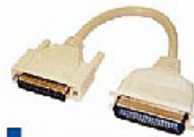
KSRP101 IEEE 1284 D-Sub 25p (M) to Centronic 36p (M) Molded Cable