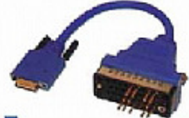
KSC0306 Cisco No. CAB-SS-V.35MT | 26p (M) to V.35 (M) Molded Cable