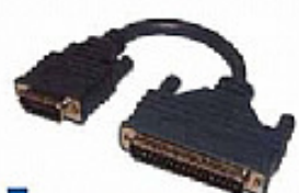
KSC0201 Cisco No. CAB-449MT | LFH 60p (M) to D-Sub 37p (M) Molded Cable