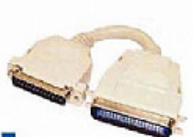
KSRP302 IEEE 1284 D-Sub 25p (M) to Centronic 36p (M) Assembly Cable