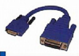
KSC0204 Cisco No. CAB-SS-X21FC | 26p (M) to D-Sub 15p (F) Molded Cable