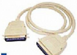
KSRP109 IEEE 1284 Centronic 36p (M) to (M) Assembly Cable