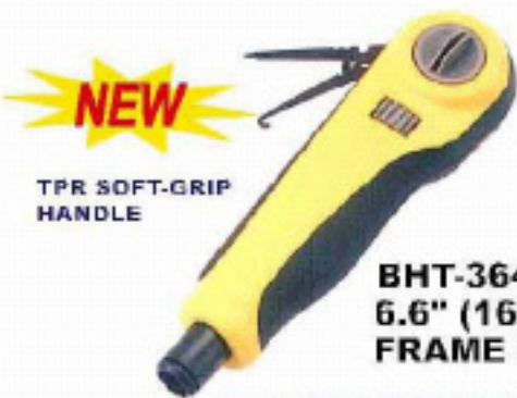
BHT-3640R 6.6" (168MM) FRAME ONLY

# WITH HI-LO PRESSURE SELECTOR BUILT-IN HOOK / SPLUDGER