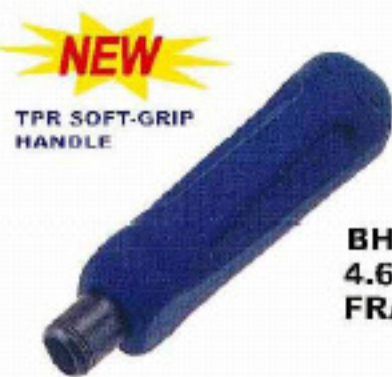
BHT-3450 4.6" (117MM) FRAME ONLY

# WITH HI-LO PRESSURE SELECTOR BUILT-IN HOOK / SPLUDGER