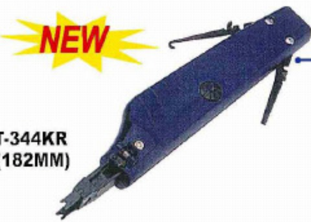
BHT-344KR 7.2" (182MM)