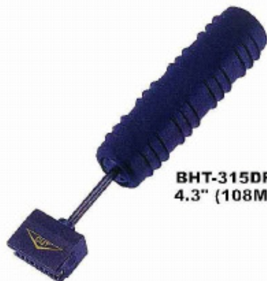
BHT-315DR 4.3" (108MM)