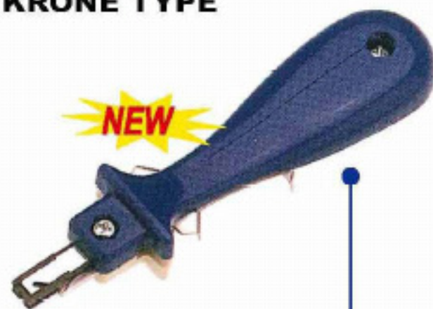
BHT-320 5.7" ( 144.5MM )

BHT-320 FOR SEATING WIRE INTO NORTHERN TELECOM TERMINAL BLOCK SPRING LOADED FOR SEATING AND REMOVING WIRES EASILY.