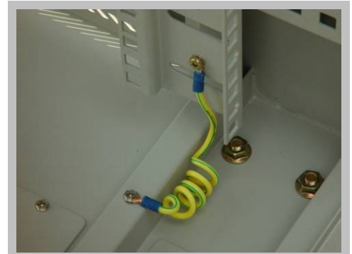
Earthing holes for main parts